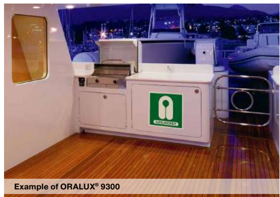
Example of ORALUX® 9300