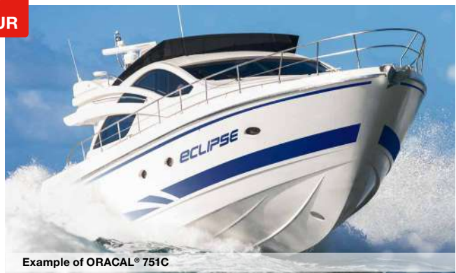
Example of ORACAL® 751C