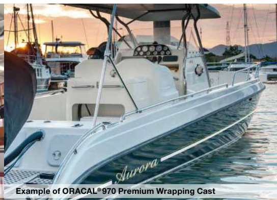
Example of ORACAL® 970 Premium Wrapping Cast