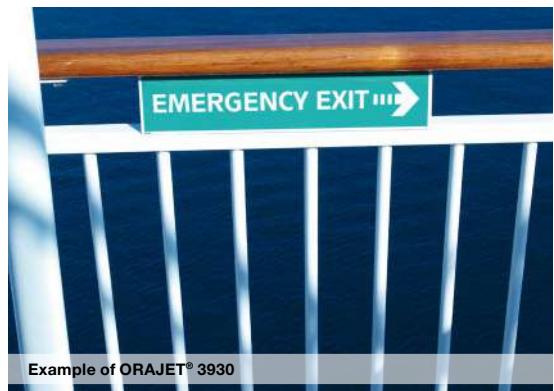
Example of ORAJET® 3930