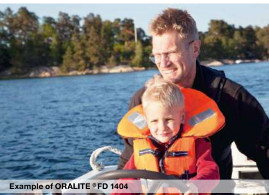
Example of ORALITE® FD 1404