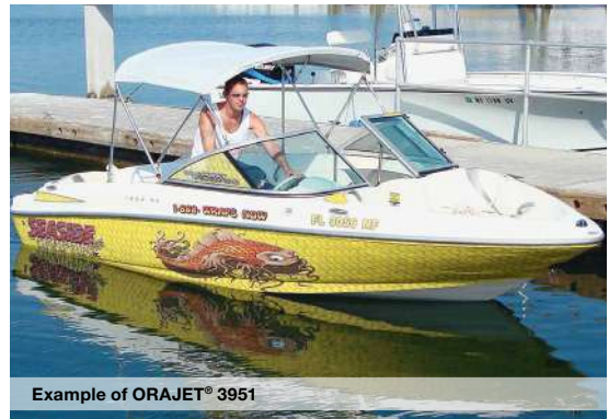
Example of ORAJET® 3951

Also available in a RapidAir® (RA) version. The RapidAir® technology allows a rapid and bubble-free application.