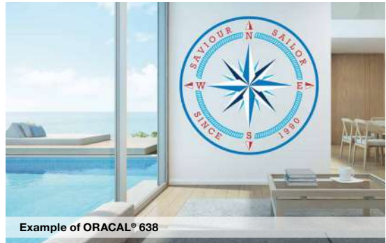
Example of ORACAL® 638