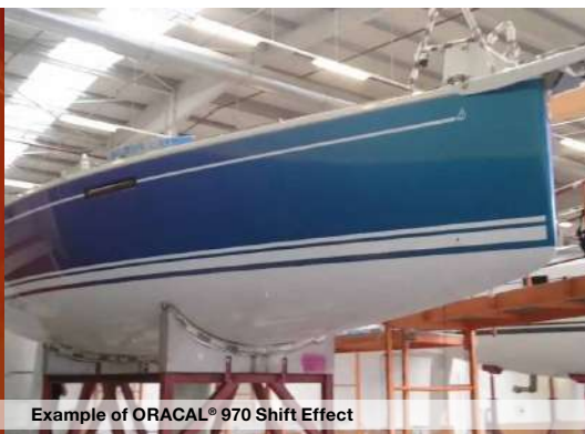
Example of ORACAL® 970 Shift Effect