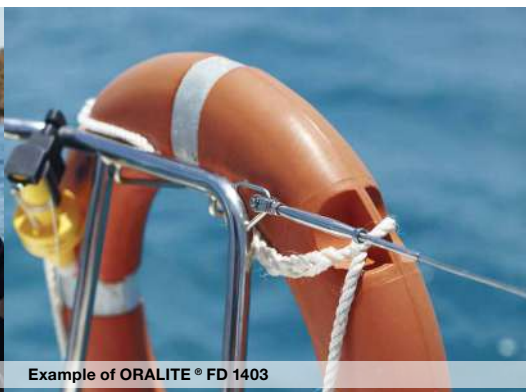
Example of ORALITE® FD 1403