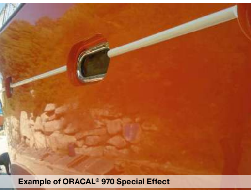
Example of ORACAL® 970 Special Effect