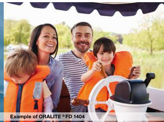
Example of ORALITE® FD 1404