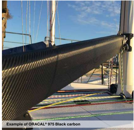
Example of ORACAL® 975 Black carbon

Black Carbon: Also available in a RapidAir ® (RA) version. The RapidAir ® technology allows a rapid and bubble-free application.